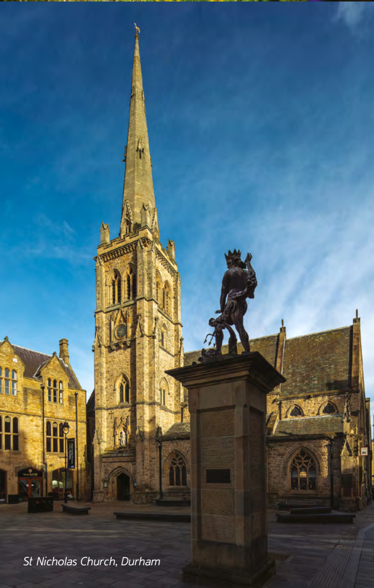
St Nicholas Church, Durham