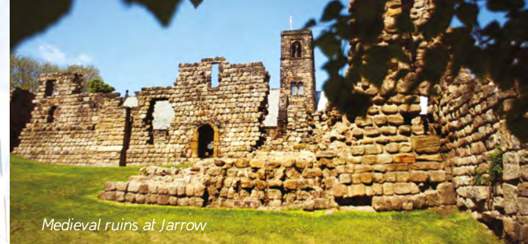
Medieval ruins at Jarrow