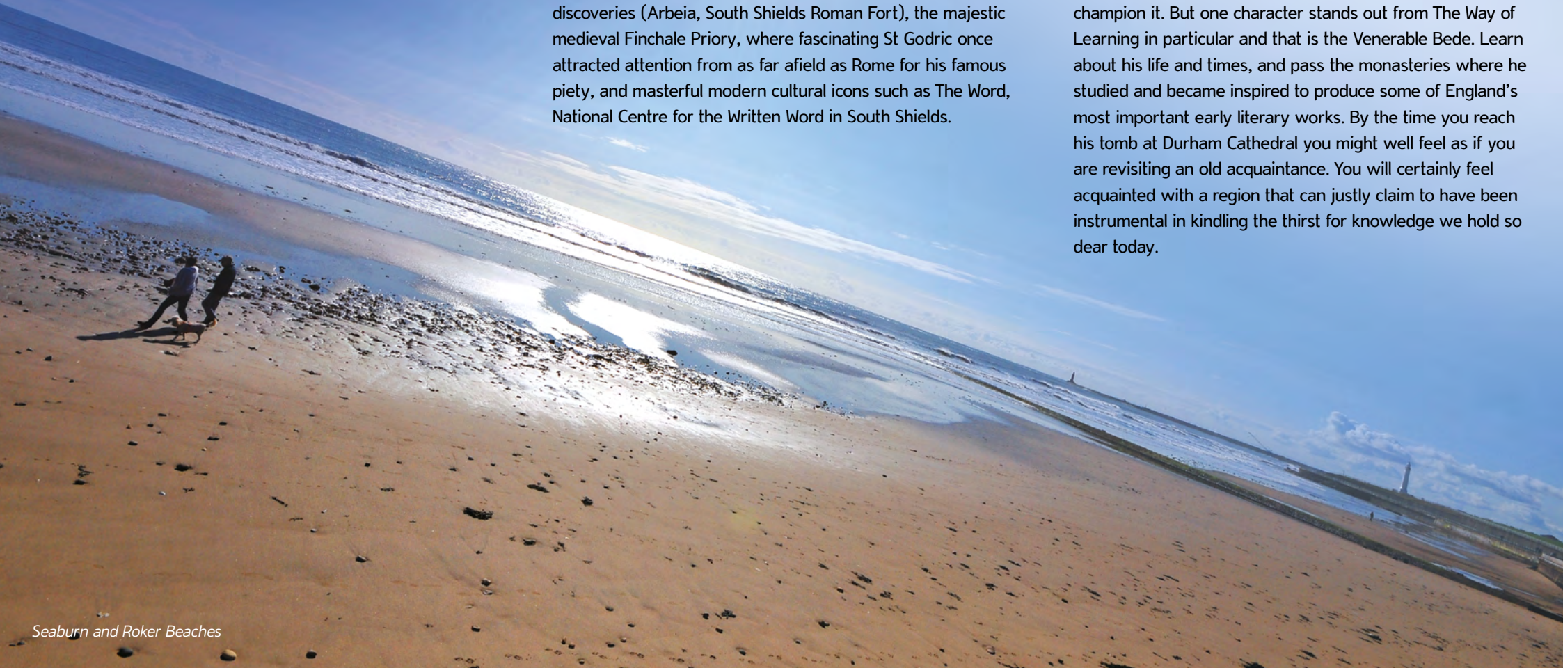
Seaburn and Roker Beaches

This, the most urban of the six Northern Saints Trails, might have less of the jaw-dropping countryside the North East invariably exhibits, but it compensates by being jam-packed with cultural eye-openers. The area has produced countless firsts (first English history book, England's first stained glass, first incandescent light bulb) and the route winds between example after example of the region's exceptional innovativeness over the centuries, and the museums that champion it. But one character stands out from The Way of Learning in particular and that is the Venerable Bede. Learn about his life and times, and pass the monasteries where he studied and became inspired to produce some of England's most important early literary works. By the time you reach his tomb at Durham Cathedral you might well feel as if you are revisiting an old acquaintance. You will certainly feel acquainted with a region that can justly claim to have been instrumental in kindling the thirst for knowledge we hold so dear today.