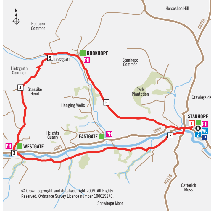
Snowhope Moor