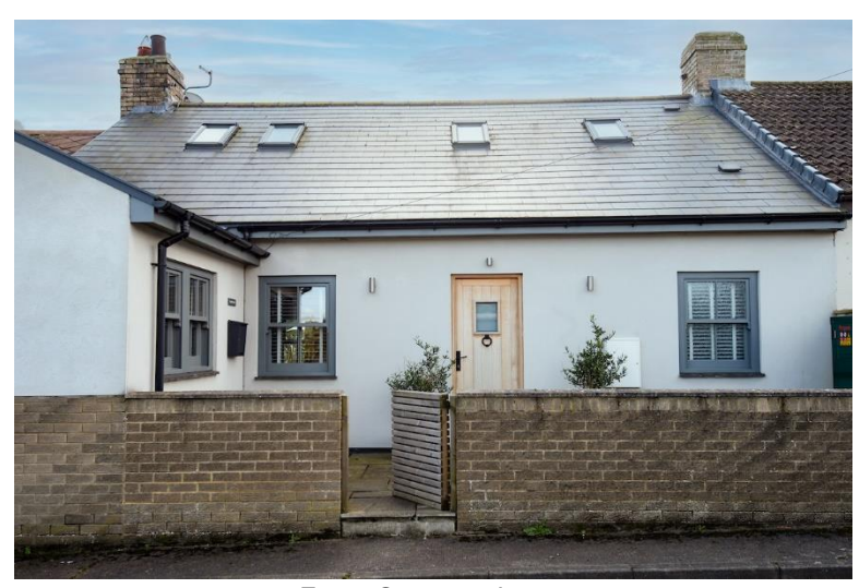
Front Courtyard area