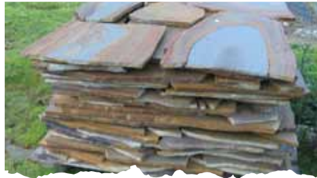
Thin sandstone slabs cut by hand at Ladycross Quarry