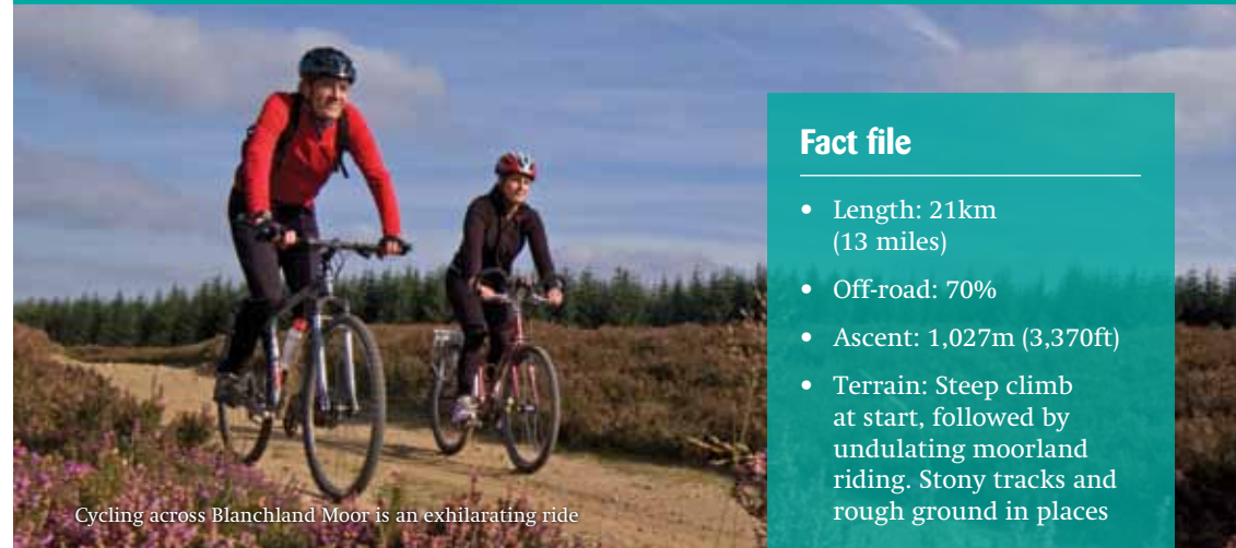
Cycling across Blanchland Moor is an exhilarating ride

This stunning ride starts at Baybridge, close to the village of Blanchland. You'll follow the Carriers' Way across Bulbeck Common, alive with the evocative calls of wading birds in the spring and early summer.