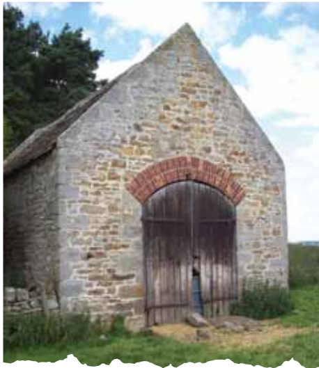
This barn at Wester Byres was used to store bark chips used in the Hexhamshire leather tanning industry