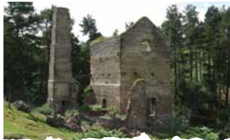
The 19th century engine house at Shildon