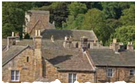
Roofs in Blanchland are made out of sandstone from Ladycross Quarry

NORTH PENNINES Area of Outstanding Natural Beauty